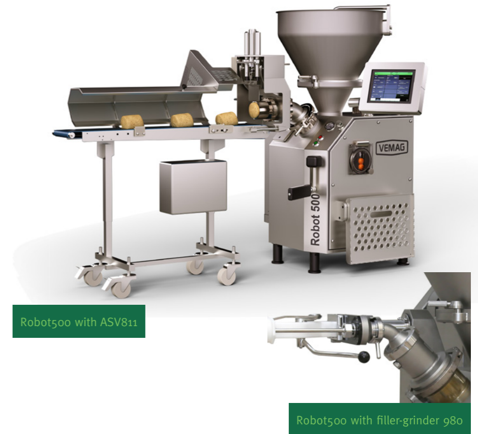
Robot500 with ASV811